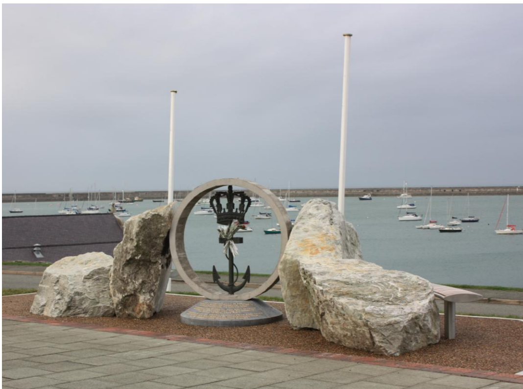
The Memorial unveiled in Holyhead.